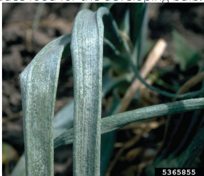
Figure 1. Whitening of onion leaves from the feeding of thrips.

Thrips feed on the leaves of onion plants, causing the leaves to turn white (Figure 1). High-level infestations cause significant leaf damage that results in a reduction of photosynthetic area and the plant's ability to produce food for the developing bulb. Infestations that develop during the early stages of bulb formation have the largest impact on bulb size and quality. Infestations later in the season are less problematic, as onions can tolerate higher populations of thrips when they are closer to harvest. Thrips feeding damage affects the leaf quality of green onions because of the formation of feeding scars. 1 Thrips are also a vector of the Iris yellow spot virus on onions.