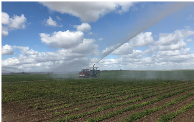
Figure 1. A sprinkler gun irrigation system.

It has been said that “vegetables are nothing but nicely packaged water,” which emphasizes the importance of water management in vegetable crop production. 1 Optimal vegetable production depends on the appropriate and timely availability of water during the cropping season. This usually requires the use of irrigation even in areas where regular rainfall is common.